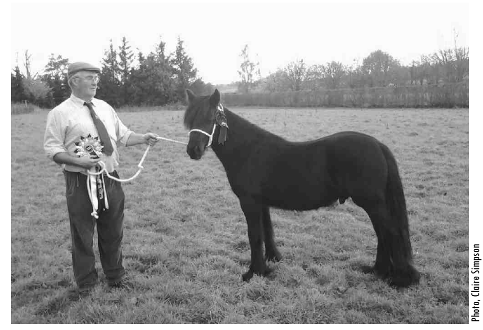
Wellbrow Mikado won the yearling class and the youngstock reserve championship.

plenty of good ponies on show and thanked the organisers for a very enjoyable day.