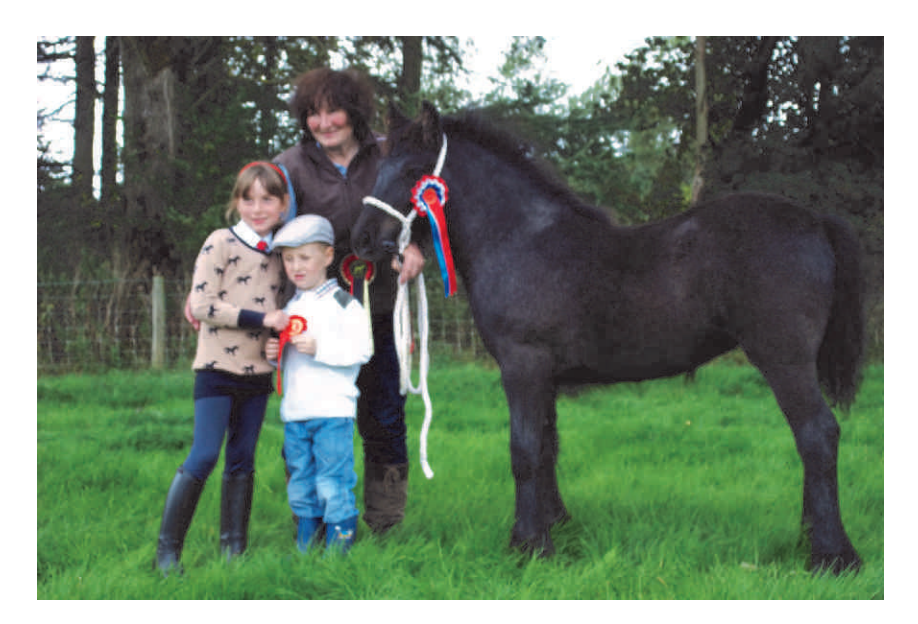
Carrock Elsa, the Cockbain family's 2014 filly foal, at Crosby Ravensworth Show, where she was champion. Carrock Elsa was shown ten times in 2014, winning 10 first prizes, Champion at Crosby Ravensworth and reserve Champion at Penrith and Eggleston shows.

Below, Underwoods Tom Tom competing in his first dressage outing at Fellbridge, West Sussex.