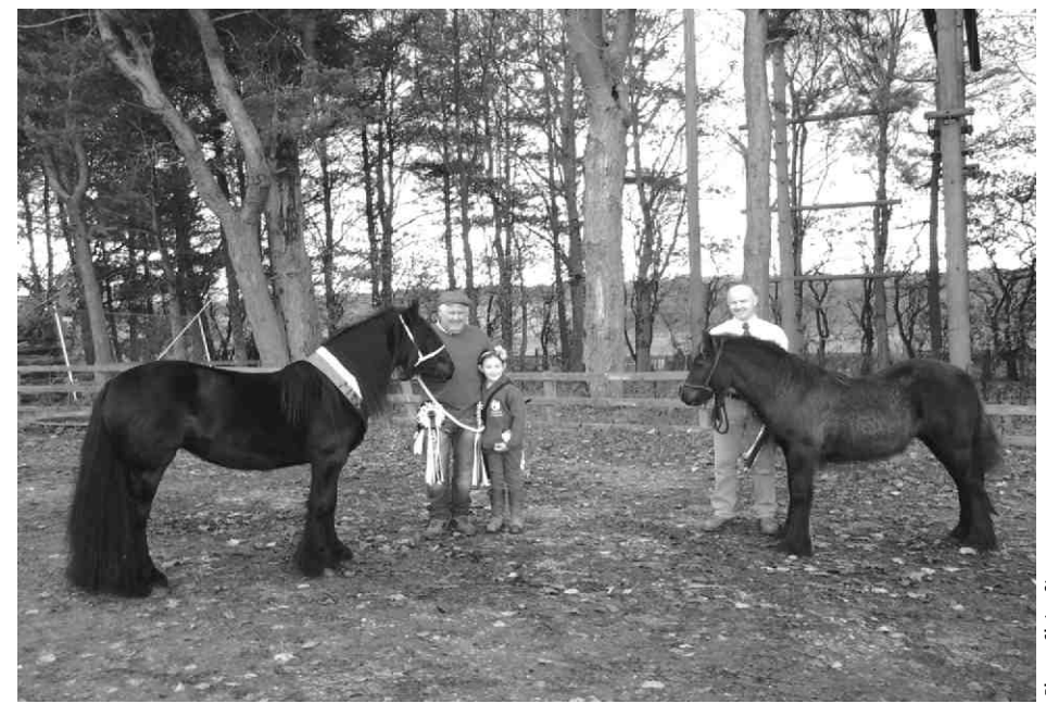
Supreme Champion Lunesdale Moonlight and Reserve Champion Bracklinn Ella.