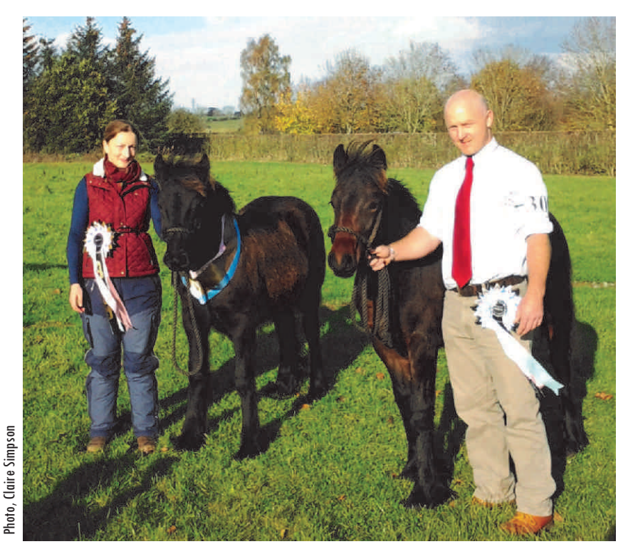
Left: Bracklinn Ella, Winner of the Champion Foal Trophy. Right: Reserve Champion Bracklinn Glayva.