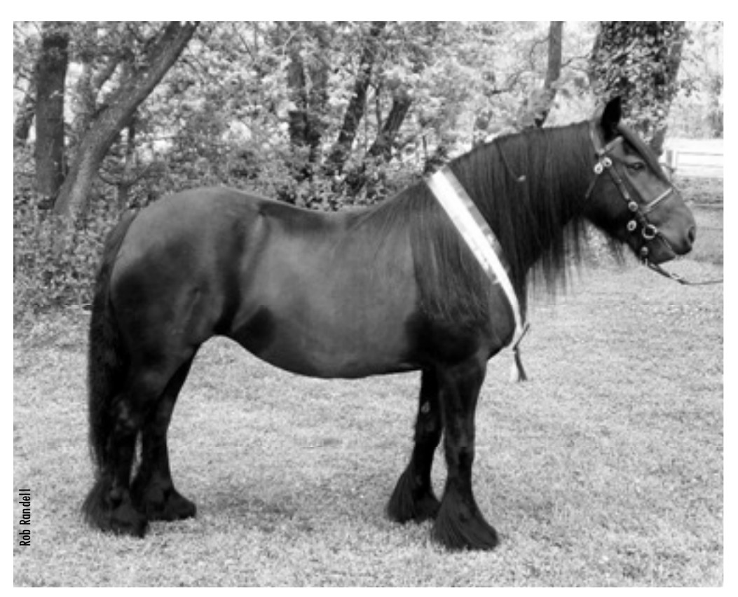
Penny Randell's Townend Skylark, Supreme Champion at South Cumbria Fell Pony Show. 5 year old Geld mare by Townend Sky x Heltondale Bonzo Boy. Skylark was also Supreme Champion Horse at Skelton Show against all breeds.