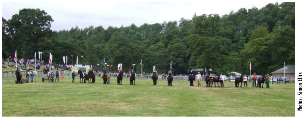
Lowther Show. An impressive line-up of Fells with their riders, drivers and handlers ready to show as e the talents of the breed. They put on displays on both days—see below—