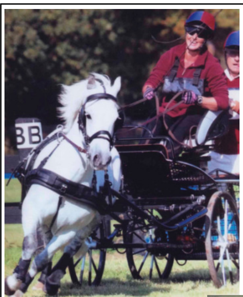
Society Calendar for 2016

Twelve stunning images of Fell ponies £5.50 plus £1.50 p & p