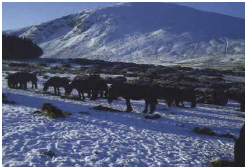
Christmas cards for 2014