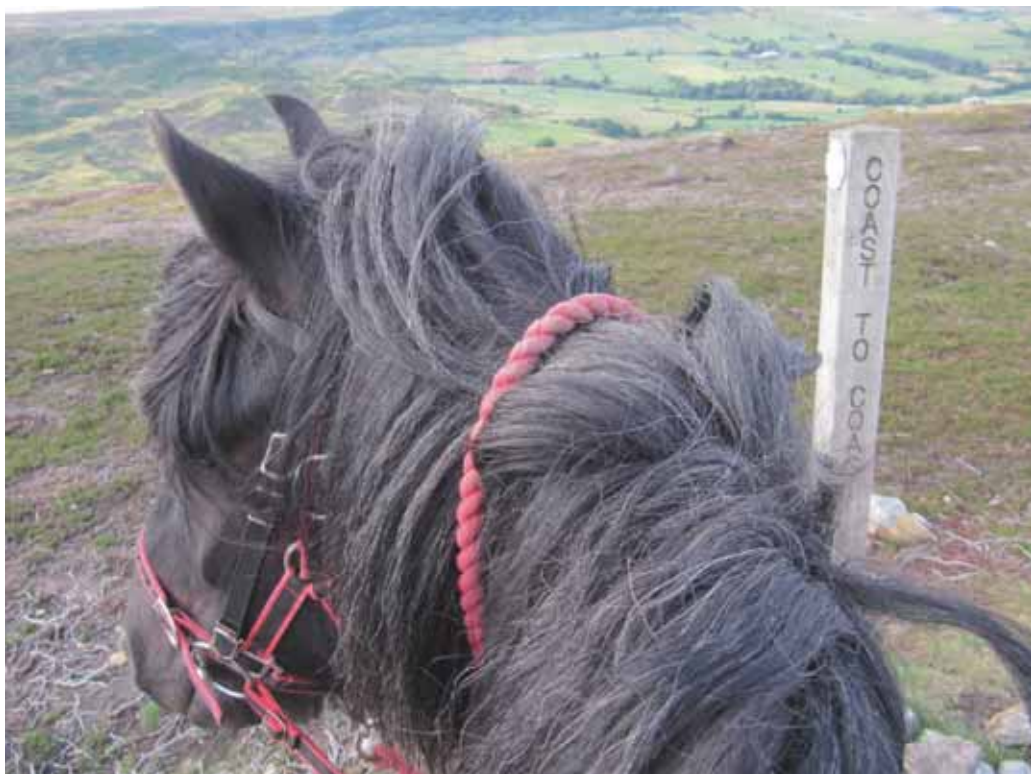
Vyv Wood-Gee's Hoddom King Kong providing the perfect view on the Coast to Coast route.