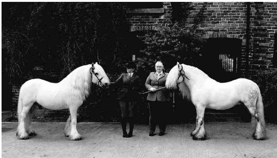
Winners of the Pairs Class at Oswestry, Murthwaite Windrush (left) and Murthwaite Iceman.