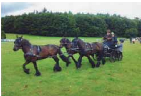
£5.00 plus £1.50 postage