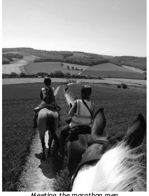
Meeting the marathon men

Well, it was the weekend, and sure enough the South Downs Way was busy. We first came across The South Downs Marathon with hundreds of runners - in the opposite direction to us - walkers bikers too. But everyone was