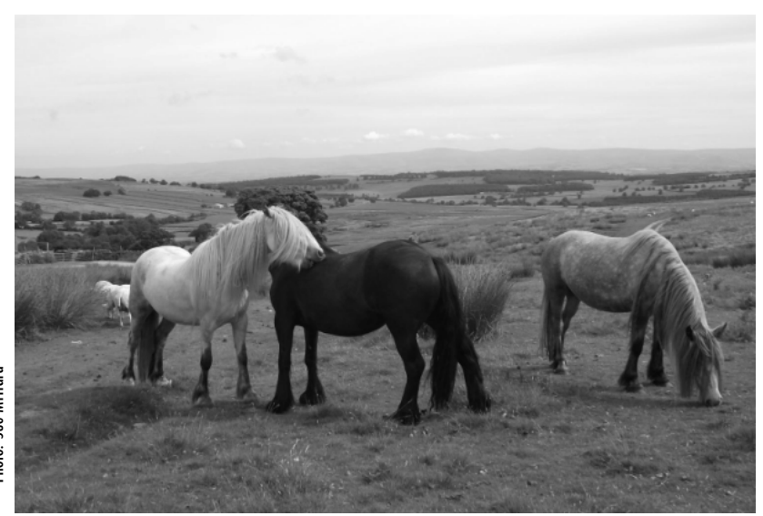
Drybarrows Swallow, Duchess of Drybarrows and Drybarrows Shauna on the fell near Askham, summer 2013.