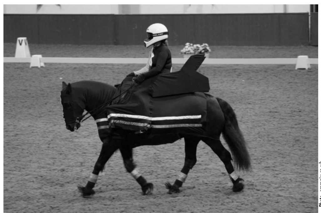
Not a Bobs led but a Teds led!