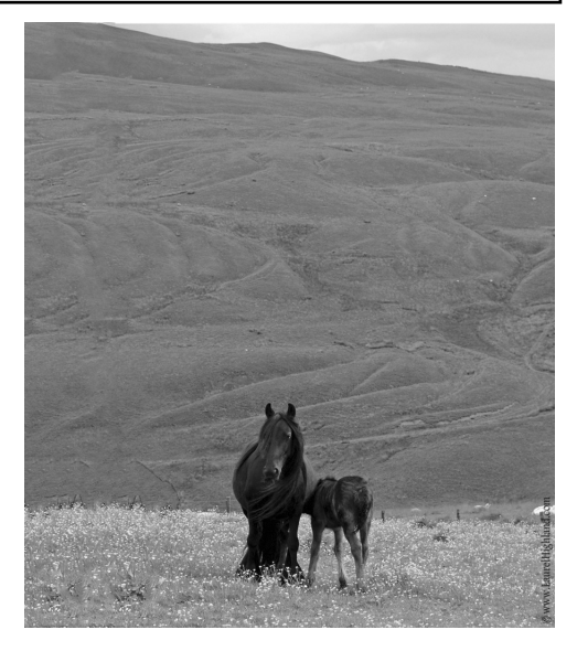
Semi-feral Fell mare and foal from Murthwaite herd, temporarily in a farm enclosure for breeding. The vast tracts of common land on the Howgill fells — their native heath where they will soon return— are seen towering above the fell gate behind them.

thin, often as a labour of love, when the cost of rearing a foal may exceed the best sales price. After all, for many of these breeders, raising Fell ponies is part of a family heritage that has gone on for many decades, if not many generations, too. The semi-feral Fell pony, which has roamed the Lakeland fells for hundreds if not thousands of years, should also be considered an important part of national heritage, and a national treasure. And yet, all things considered, one may wonder if the ponies' wildest days are over? That is, can the semi-feral herds be preserved?