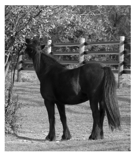
Laurelhighland Athena browsing. Fells readily adapt when their favourite sweet grass is in short supply.

Ideally, the various conservation societies of native breeds in the UK, including birds, ponies, etc., will pool