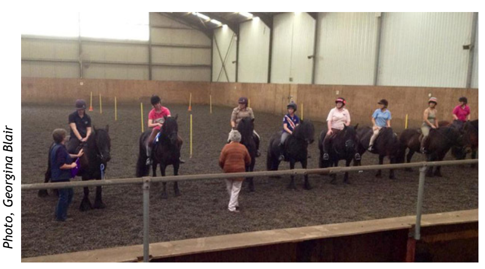
Above, rosette time following the Mounted Games afternoon at Newton Rigg during Convention Week. Below, Fell ponies grazing on the Helm, near Kendal, Cumbria.