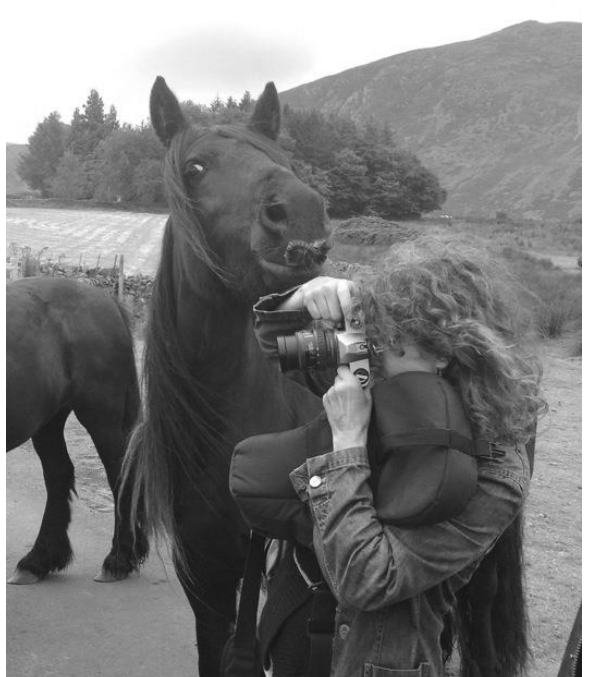
Top: Fell mares above Dufton, 11 August 2012

Left: private visit to the Townend Stud, 14 August 2012.