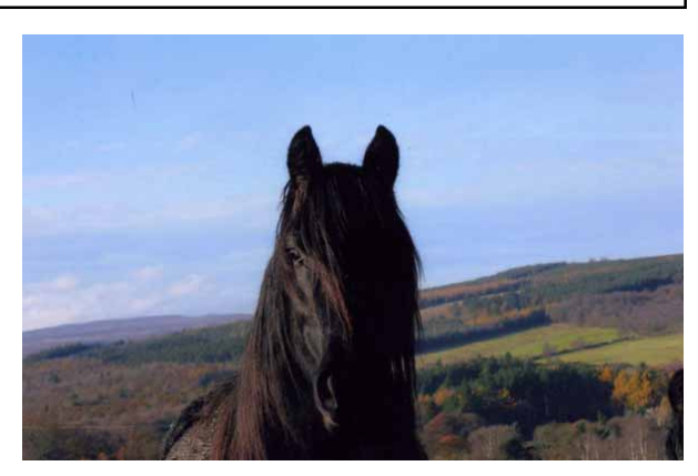
2013 Calendar £5 plus £2.50 P & P