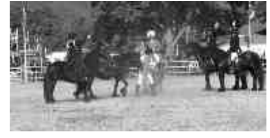
Dick Turpin Parade 2009

This year Fell Pony Denmark has a broad range of activities in order to reach our goals; in March we will be attending a winter show for Mountain and Moorlands in Denmark (the first ever of its kind), and several regional shows all over the country. The national horse show in September will be visited by both show ponies and our own parade—last year we did a Dick Turpin act, but what we will do this year is still a secret.