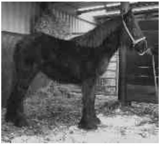
Murthwaite Aunt Polly sold for 610gns