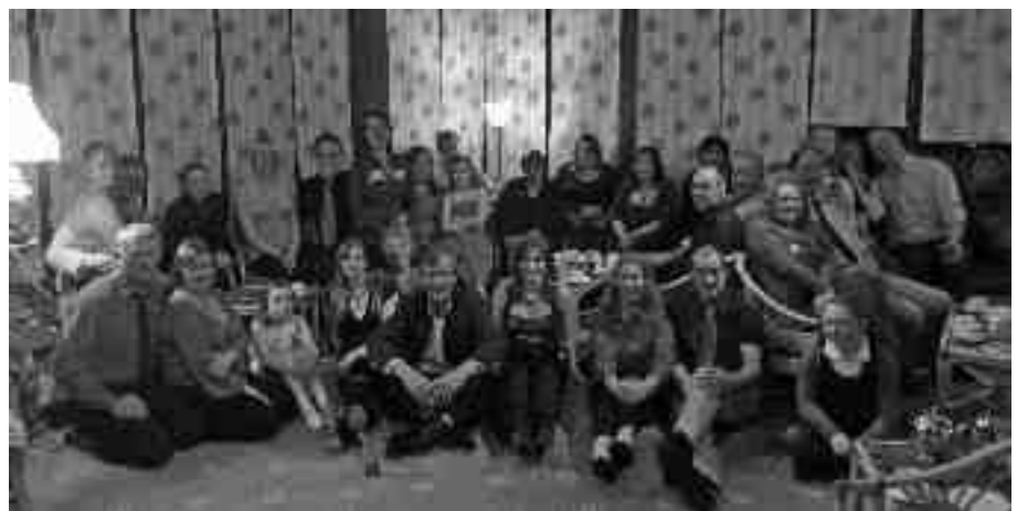
The joint DPS/FPS Dinner at Appleby Manor was a good finale to 2009. Every year our activities seem to get bigger and more enjoyable for us to get together with our ponies or without.

The last event that we have planned will be the joint FPS/DPS Area Christmas Dinner. The 2010 Christmas Dinner will be on the first Saturday in December, the 5th. Whilst we all had a super time at Appleby Manor, we will change the venue next time to somewhere a little less formal, just for a change.