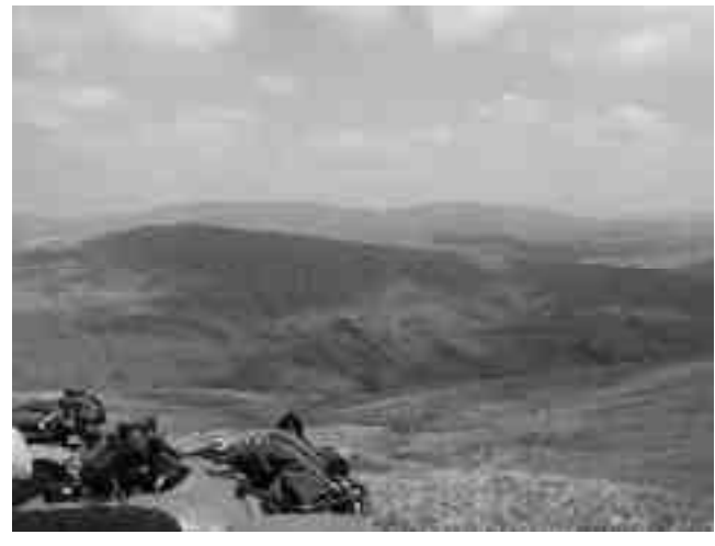
Showing how vast the Howgill Fells really are. (Group photo in centre pages).