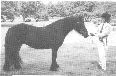
Champion Fell Pony Townend Bonny

Southern Fell Pony Champion: Townend Bonny Reserve: Underwoods Fortune