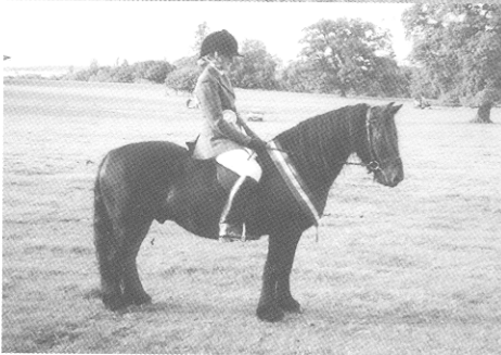
Reserve Champion Underwoods Emperor