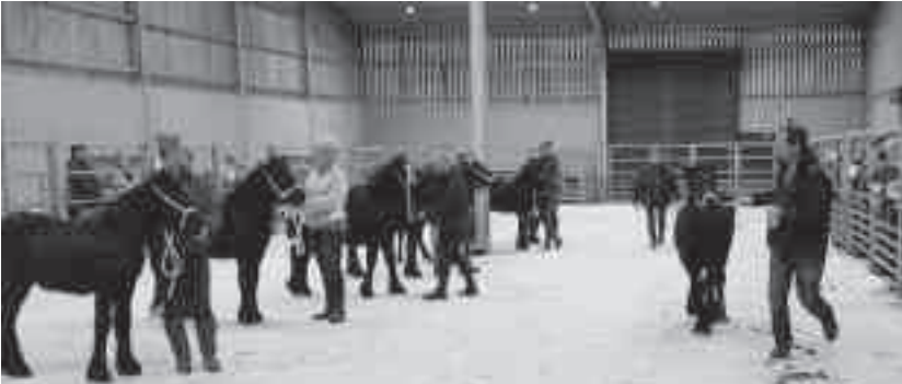
Judging in progress at North West Auctions - the Foal class at the FPS Show & Sale in October 2017