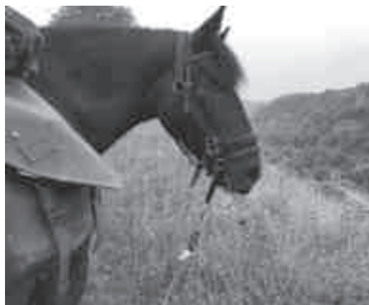
Foxy looking back down into Chee Glen

We set off on our trip on 29th June, having taken two days to travel down from N.Ireland. The starting point for horses, at Hartington, is a great facility, with a trough, shelter and a safe, enclosed area for unloading etc The first day largely follows a disused railway line.