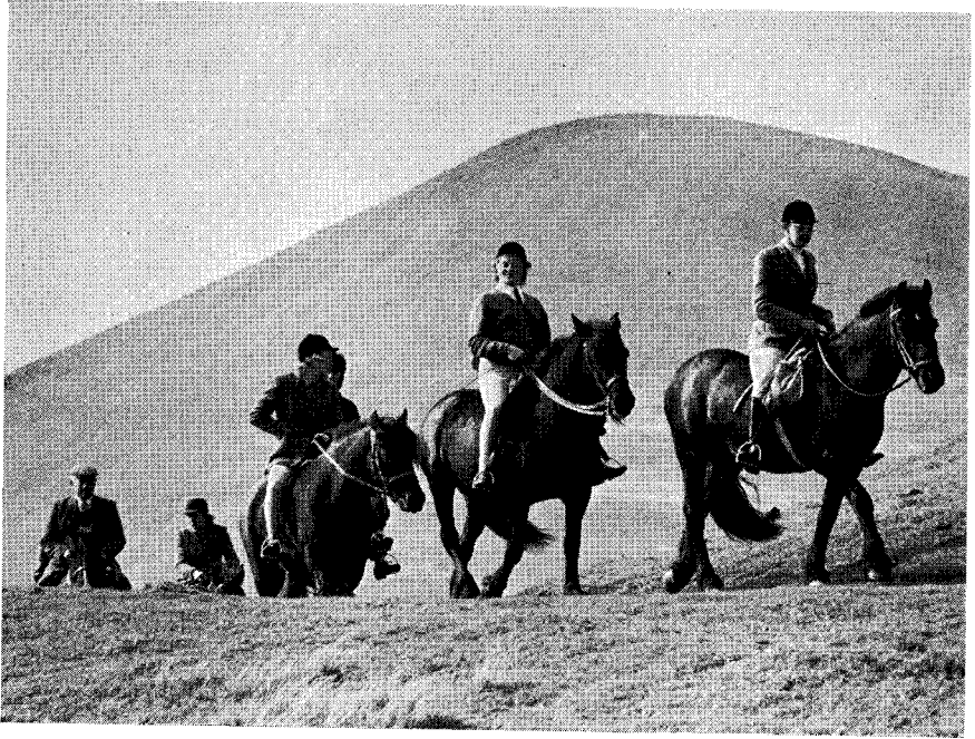
Riding to High Cup Nick