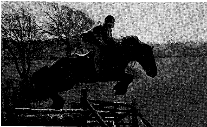
James and Tufty competing in the South Northumberland Hunter Trials

Mares chosen for their riding qualities, run on the Lammermuirs under natural conditions. Foals are carefully handled to produce well-mannered ponies suitable for all kinds of riding activities, for people of all ages.