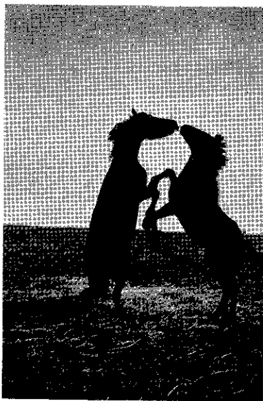
Fell Ponies Rampant or The Challenge

Send your photographs with 25p entry fee for each entry to the Editor by 31st January 1976.