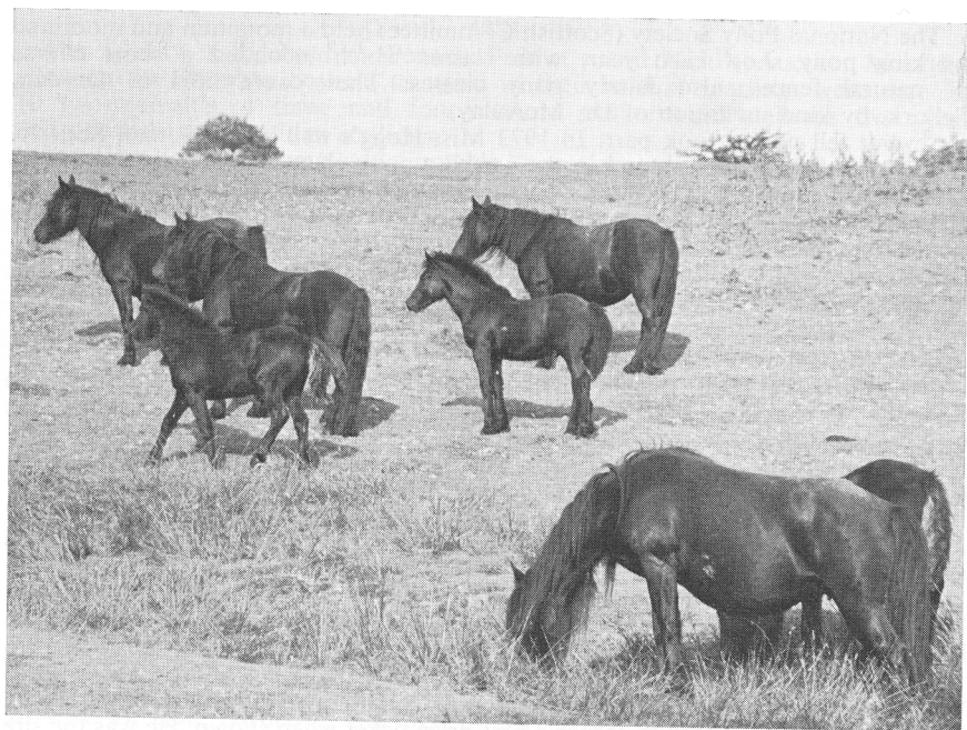
Lownthwaite Ponies at Home