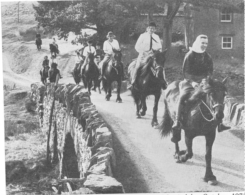
Crossing the bridge at Wintercrag in Martindale, October 1971