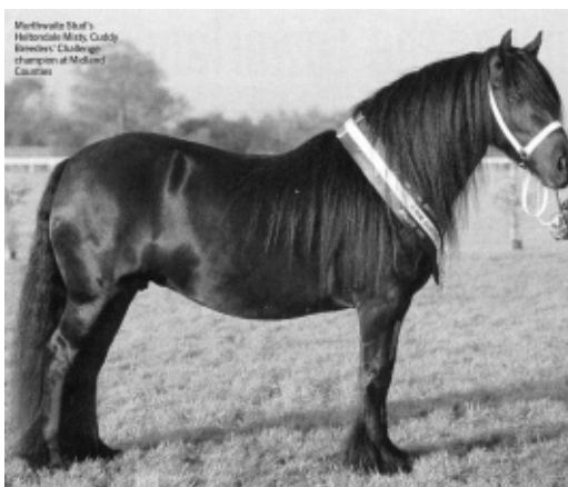
A good example of a Fell Pony -

Thomas Capstick's Heltondale Misty IV, FPS Breed Show Supreme Champion in 2004