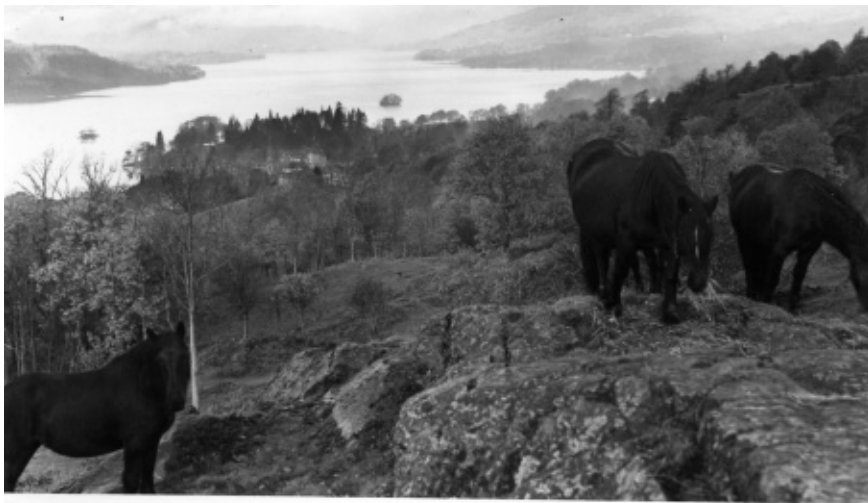
Peggy Crosland's Packway ponies above Windermere