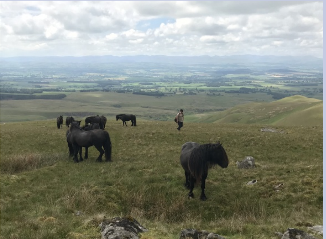
The Lownthwaite herd at home on the Pennine "east Fellside", looking west across the Eden Valley.