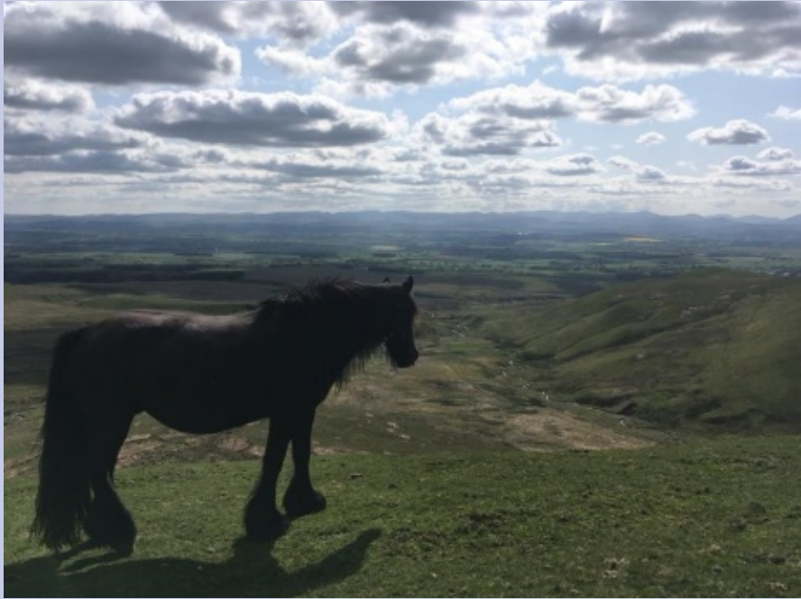
Top of the world - a Lowthwaite mare at home on the Pennines.

If undelivered, please return to: The Fell Pony Society Bank House, Boroughgate, Appleby, Cumbria CA16 6XF