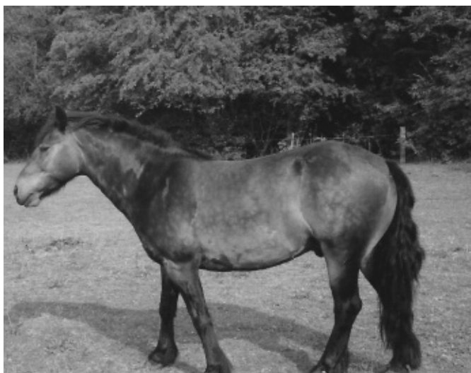
Wolds Kingfisher - see story on p76