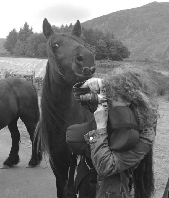
Top: Fell mares above Dufton, 11 August 2012