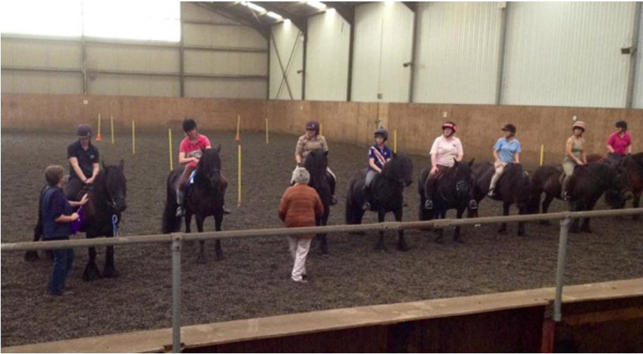
Above, rosette time following the Mounted Games afternoon at Newton Rigg during Convention Week. Below, Fell ponies grazing on the Helm, near Kendal, Cumbria.