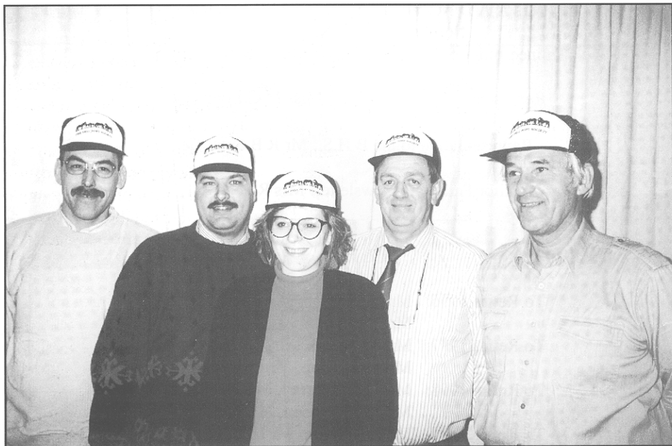
Pictured above at the first Dutch F.P.S. General Meeting, 25 February 1995.