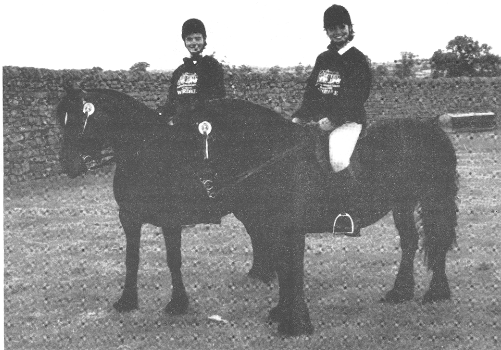
SLEDDALE GEM & SLEDDALE STAR, Barningham 1993